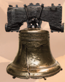
The first Independence Day celebration took place in Philadelphia on July 8, 1776. This was also the day that the Declaration of Independence was first read in public after people were summoned by the ringing of the Liberty Bell.

Lord God Almighty, in whose Name the founders of this country won liberty for themselves and for us, and lit the torch of freedom for nations then unborn; Grant that we and all the people of this land may have grace to maintain our liberties in righteousness and peace; through Jesus Christ our Lord, who lives and reigns with you and the Holy Spirit, one God, for ever and ever. Amen.