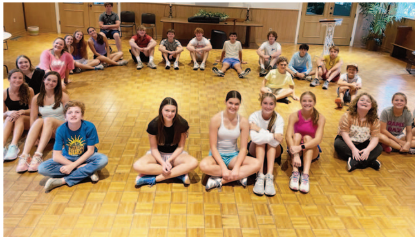
The EYC youth from St. Paul's got together with the EYC youth of The Mediator for a night of fellowship and fun at Church of the Mediator September 24. Thank you to all the youth who attended and to our wonderful volunteers, who pulled everything together!

Join us Sunday October 15 at 10:30 a.m. for our Annual Parish Picnic. We'll be gathering at Bonita Lakes in the front pavilion for an outdoor Eucharist followed by a potluck feast. Bring your chairs, family, friends and your favorite dishes to share! We will provide the paper plates, cups, ice, etc.